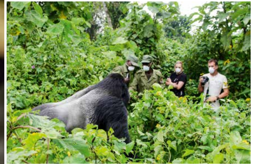
Above: a tourist group and their trackers wear masks to observe a silverback gorilla in Virunga National Park, Democratic Republic of the Congo.

keeping them that way also presents a risk, because one day a flu virus will get through and the impact might just be greater. Any non-lethal exposure to novel pathogens actually strengthens the immune system.”