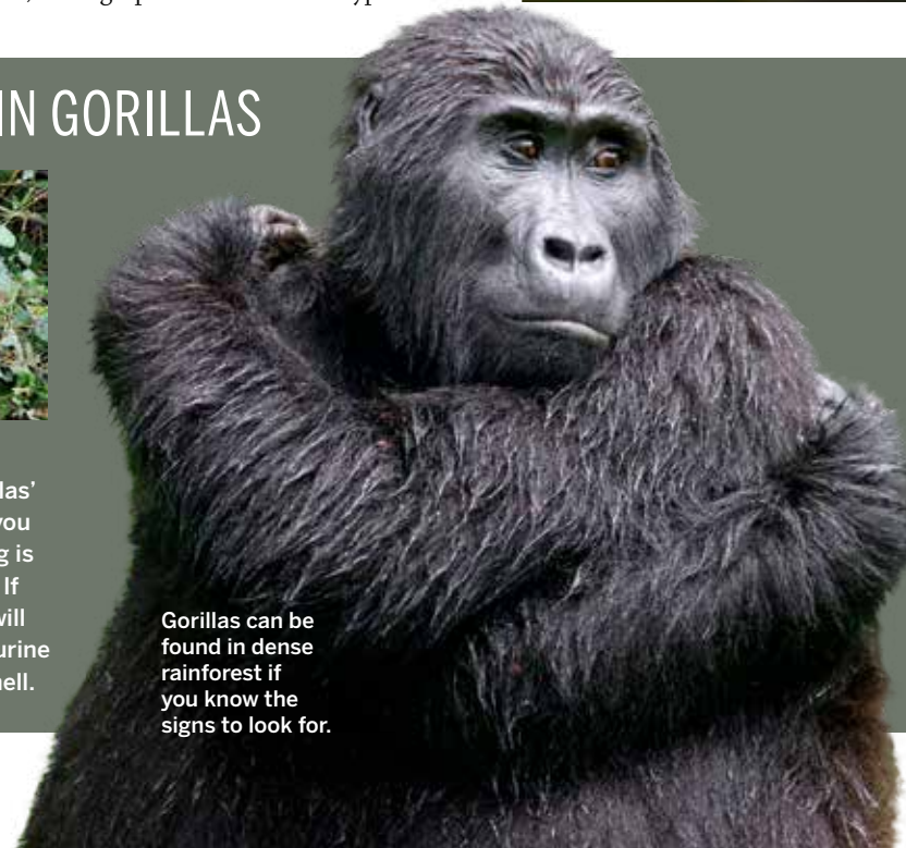
Gorillas can be found in dense rainforest if you know the signs to look for.

Droppings will indicate the gorillas’ trail, but their size will also tell you whether the ape you’re following is a silverback or a smaller gorilla. If they’re still warm your gorillas will be close by, of course. Gorillas’ urine also has a distinctive, strong smell.