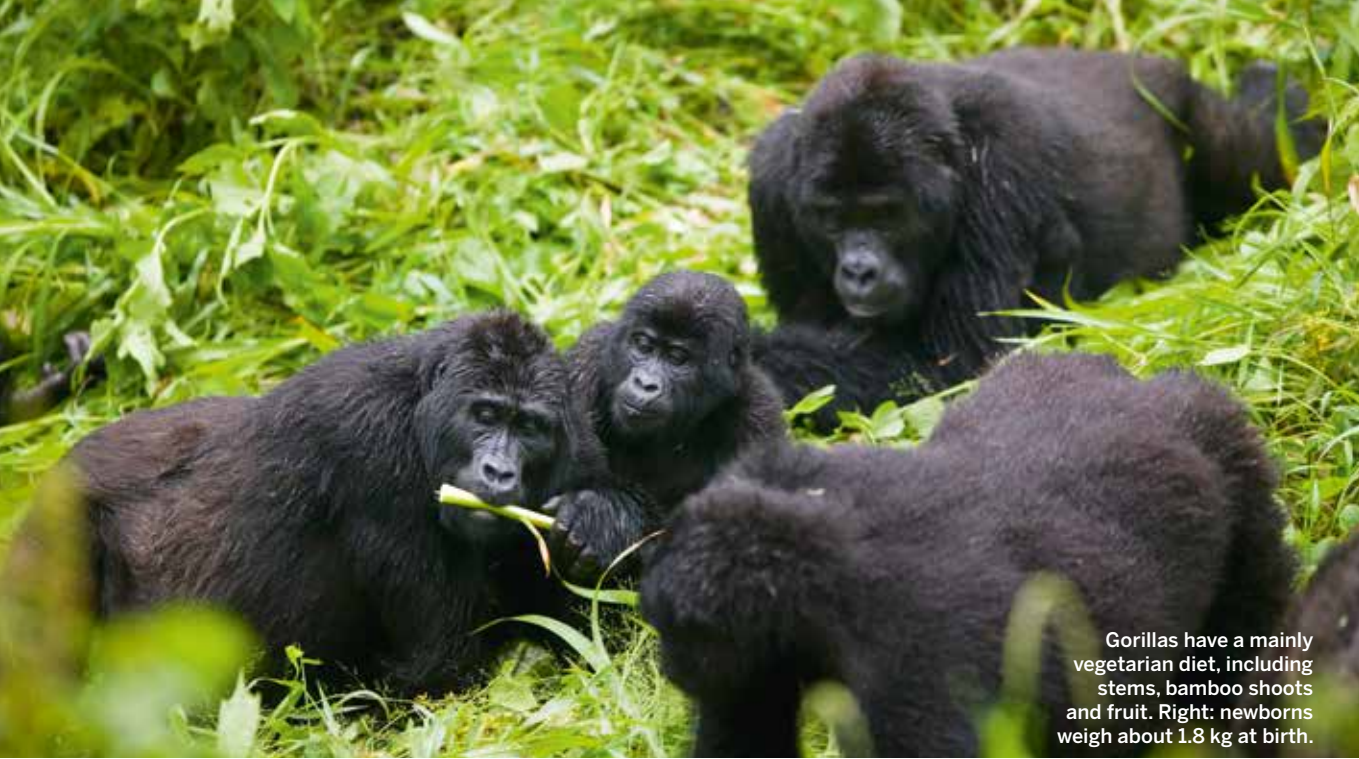
Gorillas have a mainly vegetarian diet, including stems, bamboo shoots and fruit. Right: newborns weigh about 1.8 kg at birth.