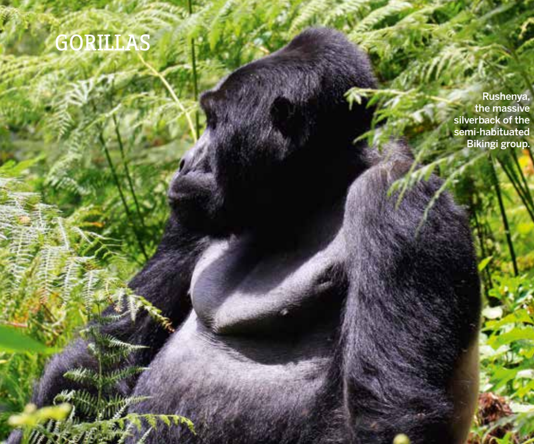
Rushenya, the massive silverback of the semi-habituated Bikingi group.

the air for fresh faeces and look all around us until we see our first gorilla high up in a tree. She rushes down, disappearing into the undergrowth. Following the sounds of breaking branches, we soon find her and her tiny baby with Rushenya about 15m away from us, sitting on a narrow path and basking in the sun.